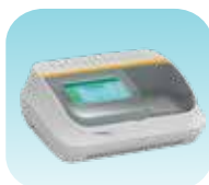
Micro Plate Reader/Washer